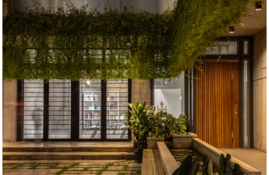
G.A.S. Lagos building exterior (L) and courtyard (R).