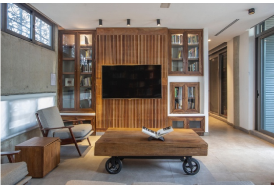
G.A.S. Library and Picton Collection.