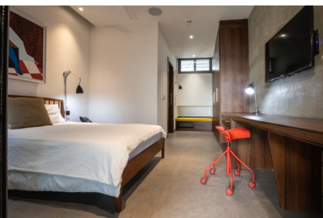
Resident's kitchen (L) and resident bedroom two (R).