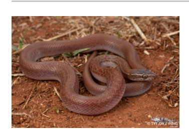
Brown House Snake

This snake thrives in woodlands and grasslands. It seeks small mammals and reptiles as a food source. It is nonvenomous and timid and likely to flee or curl up tightly if threatened.