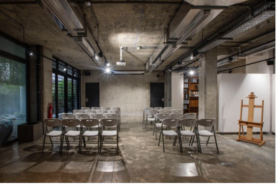
Ground floor multifunctional project space.